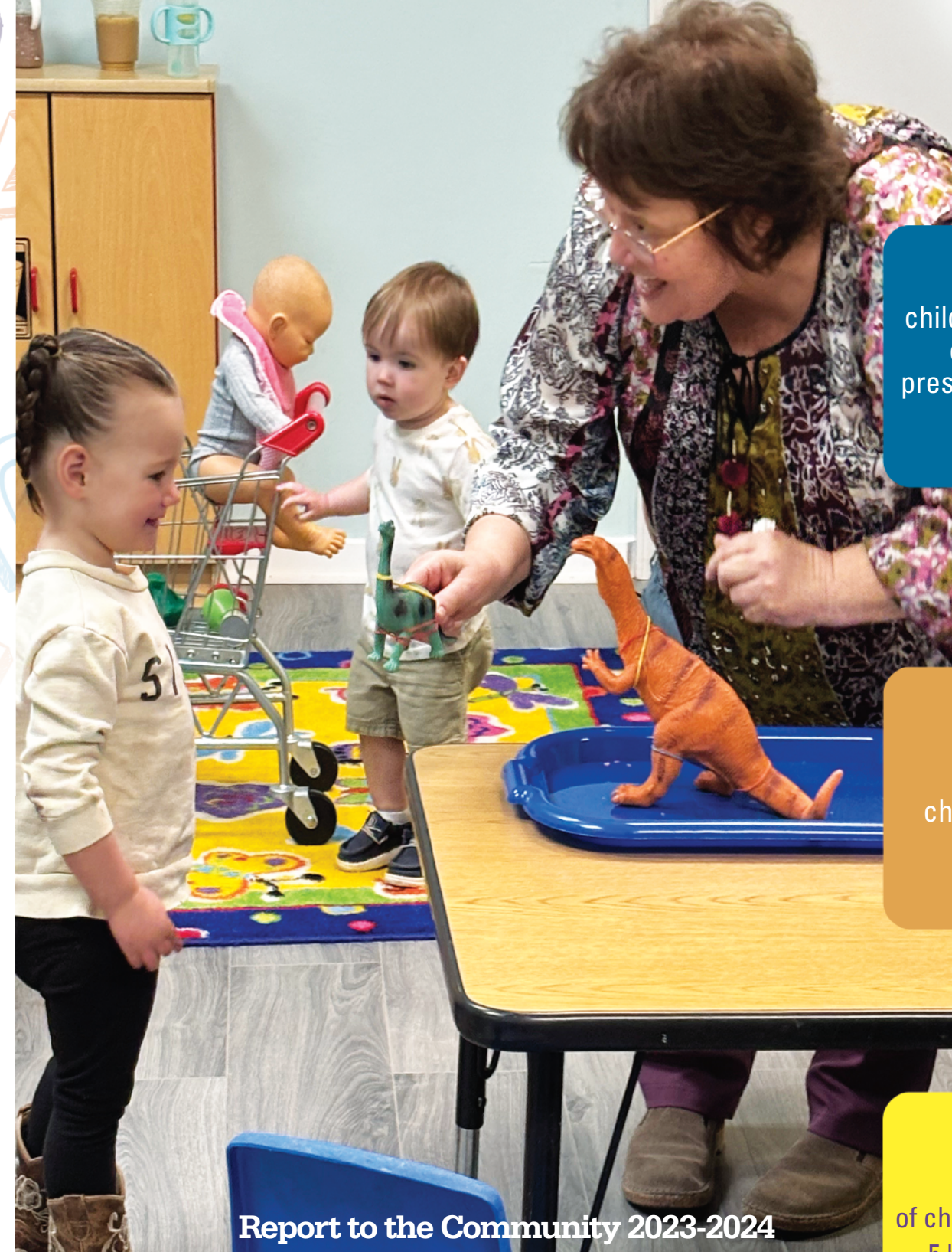
Report to the Community 2023-2024